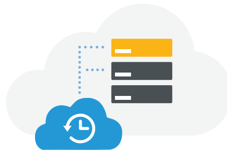
Granular and item level restore capabilities.