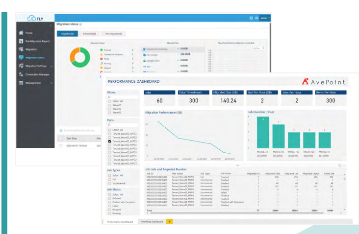
Step 3. Monitor (using built-in dashboards or Power BI Templates)