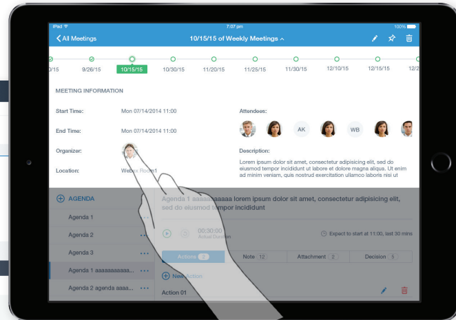
Manage Meetings on iOS

It's never been easier to create, organize, collaborate, virtually attend and review meetings!